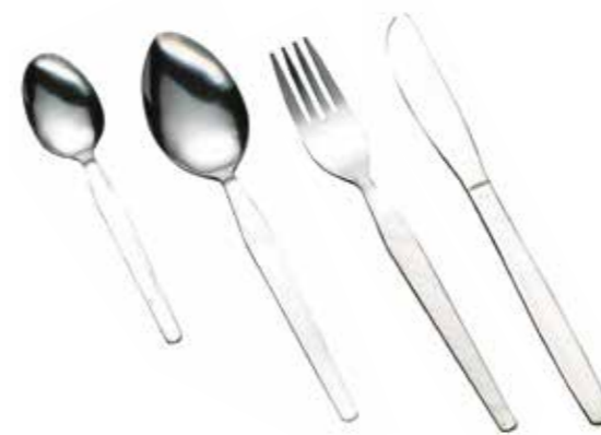
MJ7038 MJ7033 MJ7035 MJ7036

Modern, practical, easy to use and hard-wearing with a simple and practical design, versatile Britannia is suitable for a wide range of catering environments.