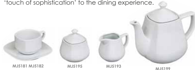
MJ5181 MJ5182 MJ5195 MJ5193 MJ5199

A collection of vitrified white porcelain, rounded square plates & bowls accompanied by matching beverage items to bring a 'touch of sophistication' to the dining experience.