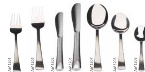
AM6201 AM6205 AM6202 AM6206 AM6207 AM6203 AM6208

For classic modern dining with two tone, mirror blades and satin finish handles.