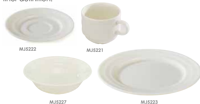
MJ5222 MJ5221 MJ5227 MJ5223

Introducing Lisbon, a stylish and elegant range of plates and bowls. Especially designed for fine dining creating the perfect ambience. Thinner and lighter pieces with finer definition.