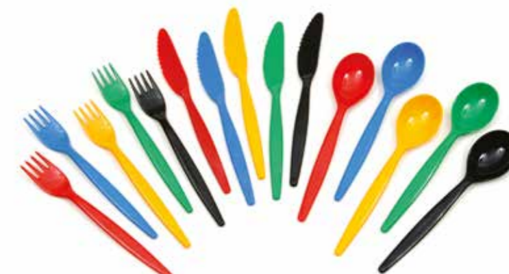
HA6271 HA6270 HA6272