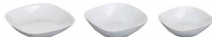
MJ5186 MJ5189 MJ5187